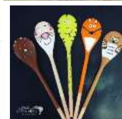
Woodland Walk Scavenger Hunt